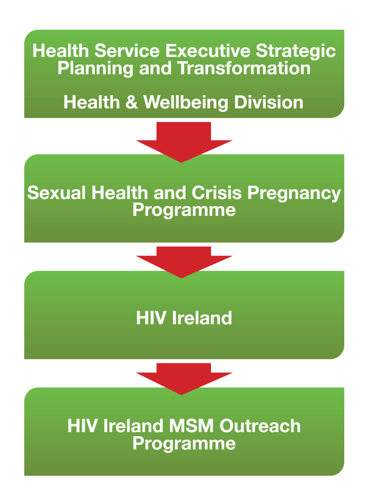
Figure 2: Organigram

In order to facilitate improved understanding of the structures and context of service delivery, an organigram (see Figure 2) was developed in consultation with the HSE Sexual Health and Crisis Pregnancy and Sexual Health Programme.